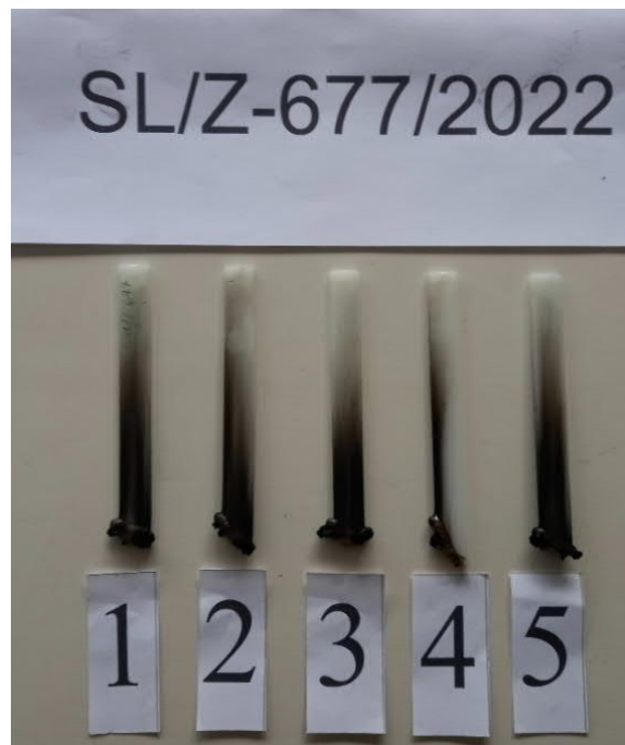
5 samples after oven conditioned